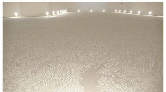
6- Nipan Oranniwesna