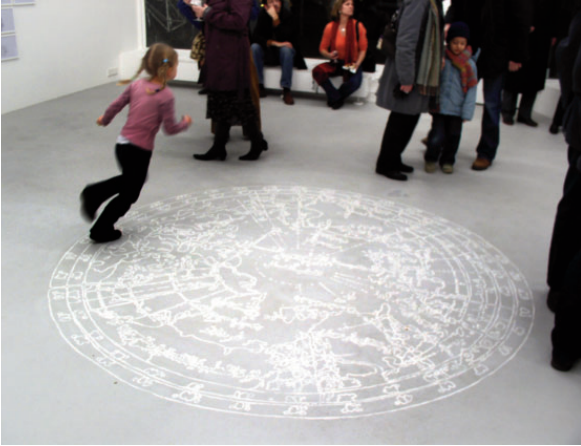
1- Katrin Ströbel