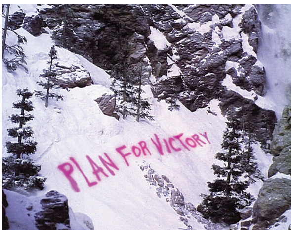
5- Elodie Pong