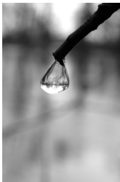
Jean-Claude Durmeyer, L'III aux trésors n°0028 , 2012 Black and white photograph