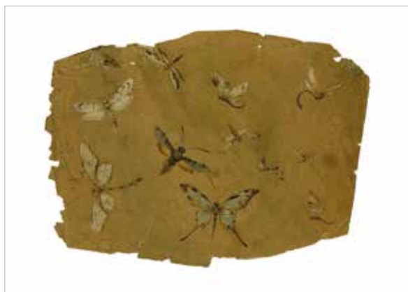
Eugène Kremer, Untitled, undated Drawing