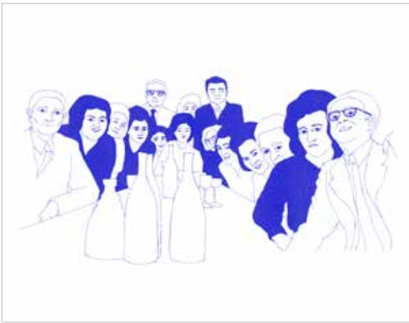
Julie Luzoir, Untitled , 2017 Drawing – Courtesy Julie Luzoir